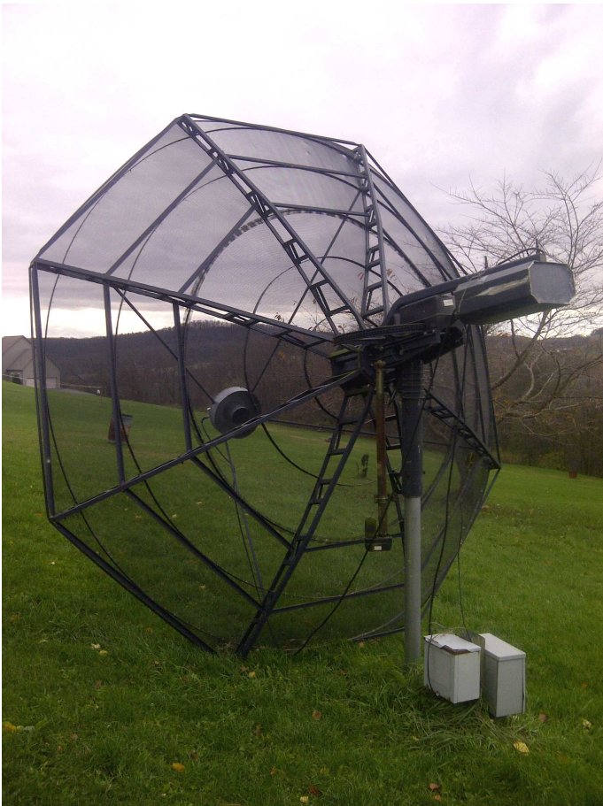
The once proud dish at Project Argus station FN11lh lies against the ground, in the aftermath of Hurricane Sandy's recent assault on the Northeastern US.