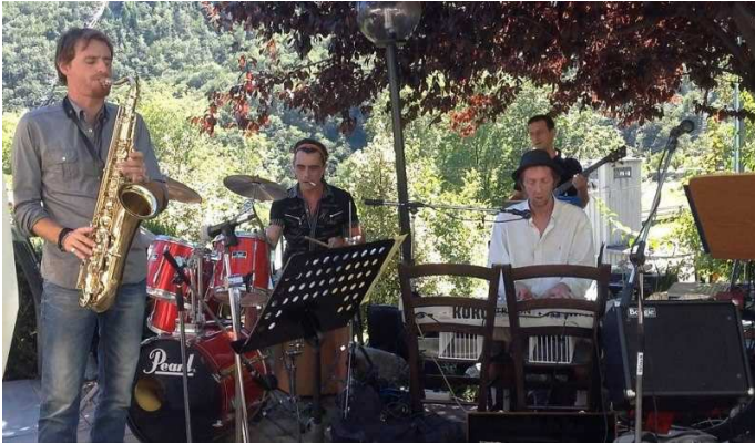
In Italy in late August, the Moon Walker's Jazz Band gave a concert dedicated to the memory of Neil Armstrong, who recently departed from Earth for the last time.