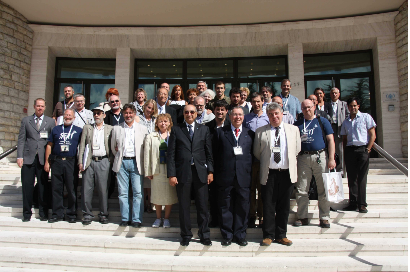
^ Among the respectable turnout at the September 2012 IAA Searching for Life Signatures conference in San Marino were half a dozen SETI League members. Two of them can be identified by their t-shirts.