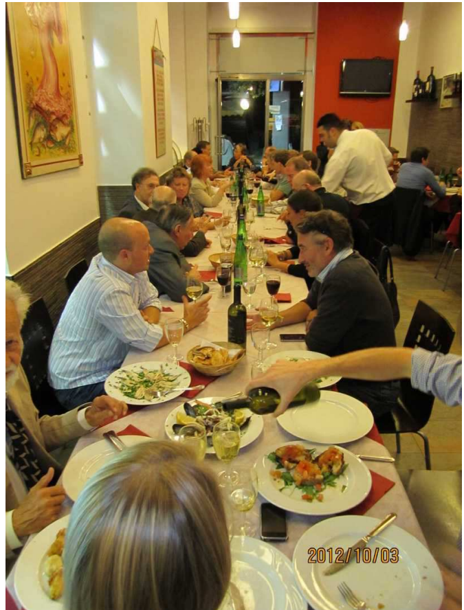
At the October, 2012 International Astronautical Congress in Naples, Italy, 24 enthusiasts gathered at a local restaurant for the annual no-host SETI dinner.