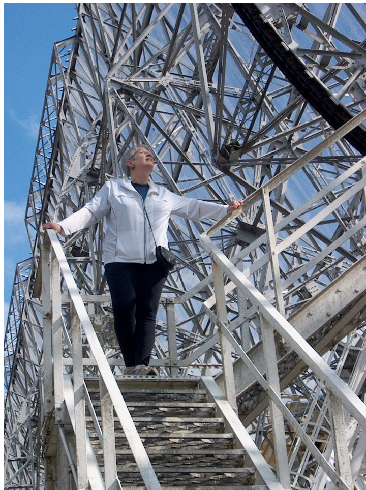
Jill Tarter scales the great decimetric wave radio telescope at Nancay, France, in this 2008 SETI League photo