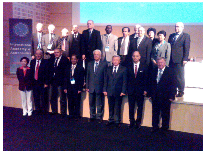
A new International Academy of Astronautics Board and Officers are inducted during Academy Day in Cape Town.