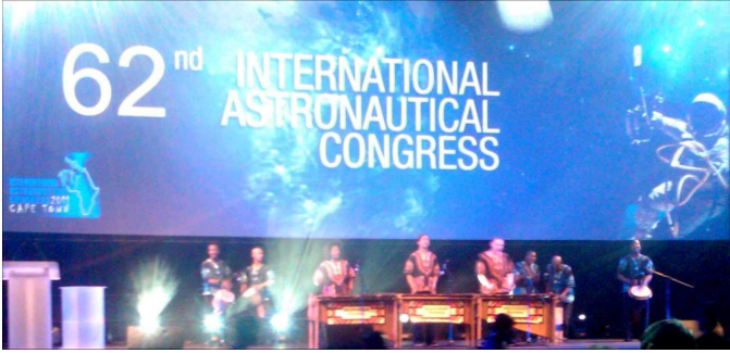
Opening ceremonies at the Cape Town IAC kicked off with a marimba band.