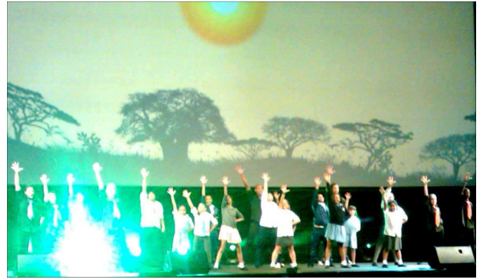
Several local student groups entertained during the International Astronautical Congress.