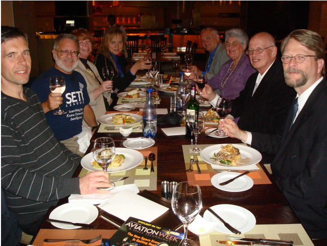
Eight SETI enthusiasts gathered for the annual IAA SETI Dinner.