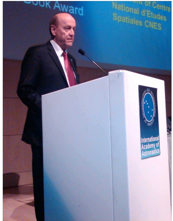
IAA Secretary General Jean-Michel Contant kicks off Academy Day, the day before the International Astronautical Congress commences.