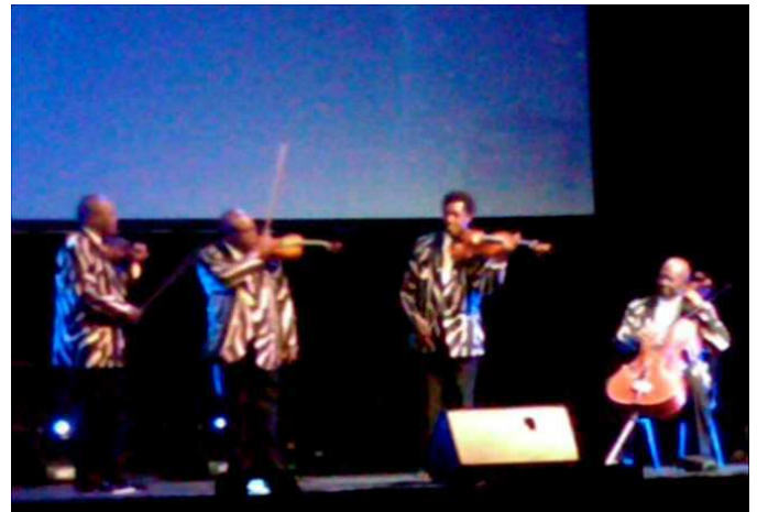
The popular Soweto String Quartet was well received at the Cape Town IAC.