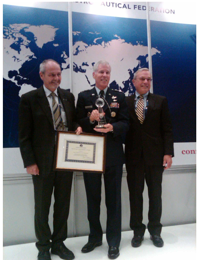
The creators of the Global Positioning System were honored with an award from the International Astronautical Federation.