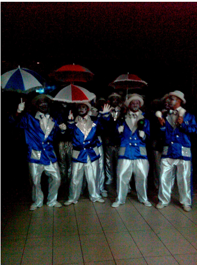
Traditional music livened up events in the Cape Town International Convention Centre.