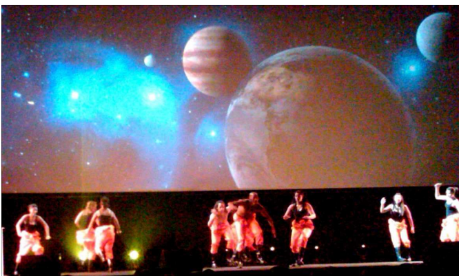
Opening ceremonies included a number of native dance acts.