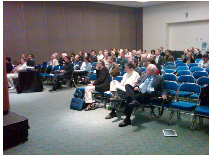
A sampling of the modest crowd attended a half-day SETI symposium at the 2010 AAAS meeting in San Diego, in February 2010.