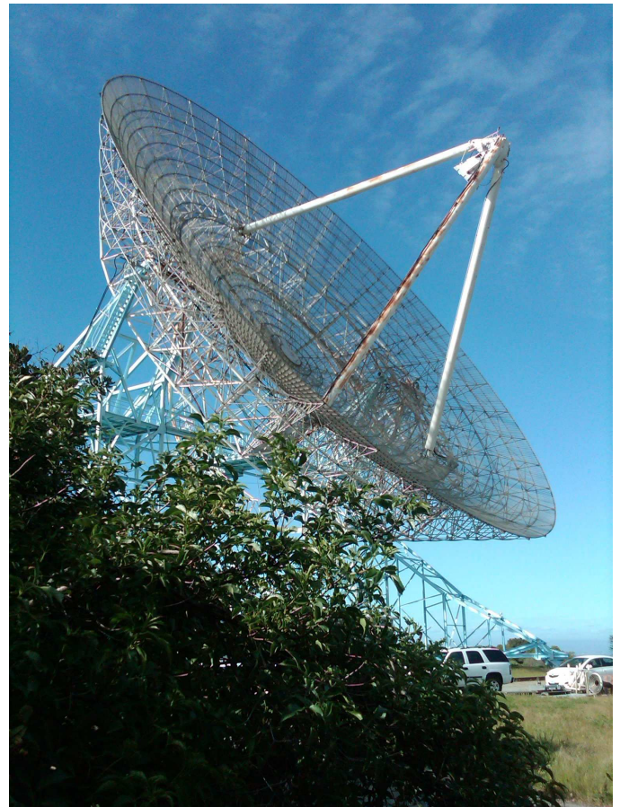
Following the SARA regional meeting at Stanford University in March 2010, participants had an opportunity to tour the Stanford Research Institute 150 foot dish facility.